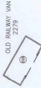
SEE LOCATION PLAN FOR POSITION OF